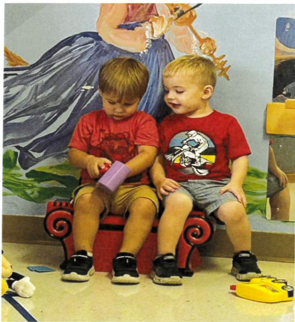
Sunshine Kids were busy kids in October. Wrapped the month up with a Halloween party.